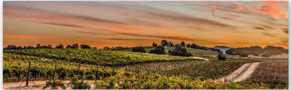
Renwood Estate Vineyard, Amador County